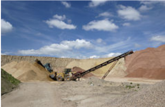
Aggregate quarrying in the UK

Cemex Island Aggregates had plans to extend its Dreemskerry Quarry on the Isle of Man refused by local planners this month. Cemex wanted to extend the quarry from a 2 acre site to a 13 acre site in the next 40 years. However planners claimed it would adversely affect local residents and road access was inadequate. Cemex plan to appeal against the decision and are “determined to pursue the matter further”.