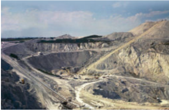
China clay production

The Highways Agency has announced that the new A30 Bodmin to Indian Queens dual carriageway will be “the largest green road project in the country”.