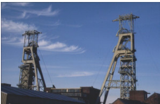
Colliery headgear

A disused coal mine in South Yorkshire is to be brought back into production after a closure of 13 years. The Hatfield Colliery near Doncaster originally closed in the coal industry privatisation of 1994. The re-opening has been prompted by rising energy prices and depleted UK gas supplies. This colliery will now become the 9 th deep coal mine in the UK , joining several other recently reopened mines.