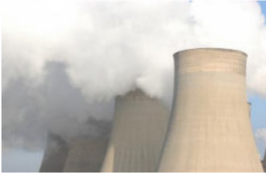
UK power generation