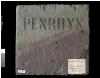
Slate from the Penrhyn quarry

An external investigation has recently been completed looking into allegations of fraud in Alfred McAlpine's Gwynedd slate quarries. The investigation has found that managers defrauded the firm by £23 million by overstating production volumes and sales for several years.