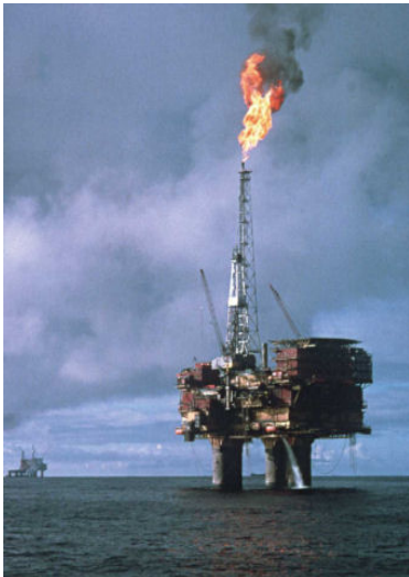
UK offshore oil rig