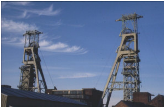
Headgear at a disused UK coal mine

Coal production has ceased at Rossington Colliery in South Yorkshire. UK Coal which owns Rossington stated the "pit has made multi-million pound losses in recent years since encountering geological problems which wiped out reserves being developed for future extraction." Reserves still remain at Rossington, however, they require major investment, in the order of £20 million, to be developed. 83 employees have left the mine since UK Coal announced plans to place Rossington on a care-and-maintenance basis. Half of these have been relocated to other UK Coal sites, whilst the remaining 224 workers will be involved in the recovery of equipment from the site and its closure.