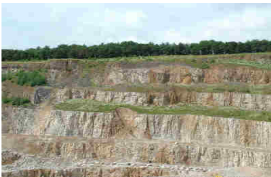
Quarry in the Peak District

A public inquiry into limestone quarrying in the Peak District has been cancelled after the Secretary of State John Prescott declared the Peak District National Park Authority's enforcement action to be null and void. The Peak District National Park is extremely disappointed by the decision but has indicated it will continue action against what it claims is "the unlawful mass extraction of limestone from Backdale Quarry, near Bakewell." The dispute centres on the current planning permission which allows the quarry operator to work vein-minerals, fluorspar and barytes, and limestone only as a secondary product, extracted in the course of working the vein-minerals. However, it became apparent that between July