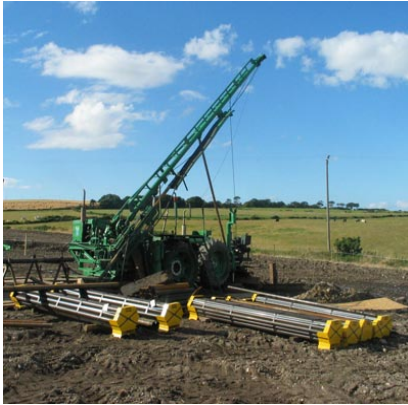
Exploration drilling in the UK