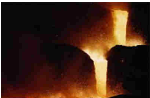
Molten metal being prepared for casting, Photo Copyright: Getty Images

Corus, one of the world's largest metal producers, has announced plans to invest £40 million in its Teesside Cast Products (TCP) business. The investment will allow the steel-making facility to increase the quality and capacity of its output by modernising its two slab casters. In addition, the company will acquire a dedicated fleet of rail wagons to transport slab to Teesport.